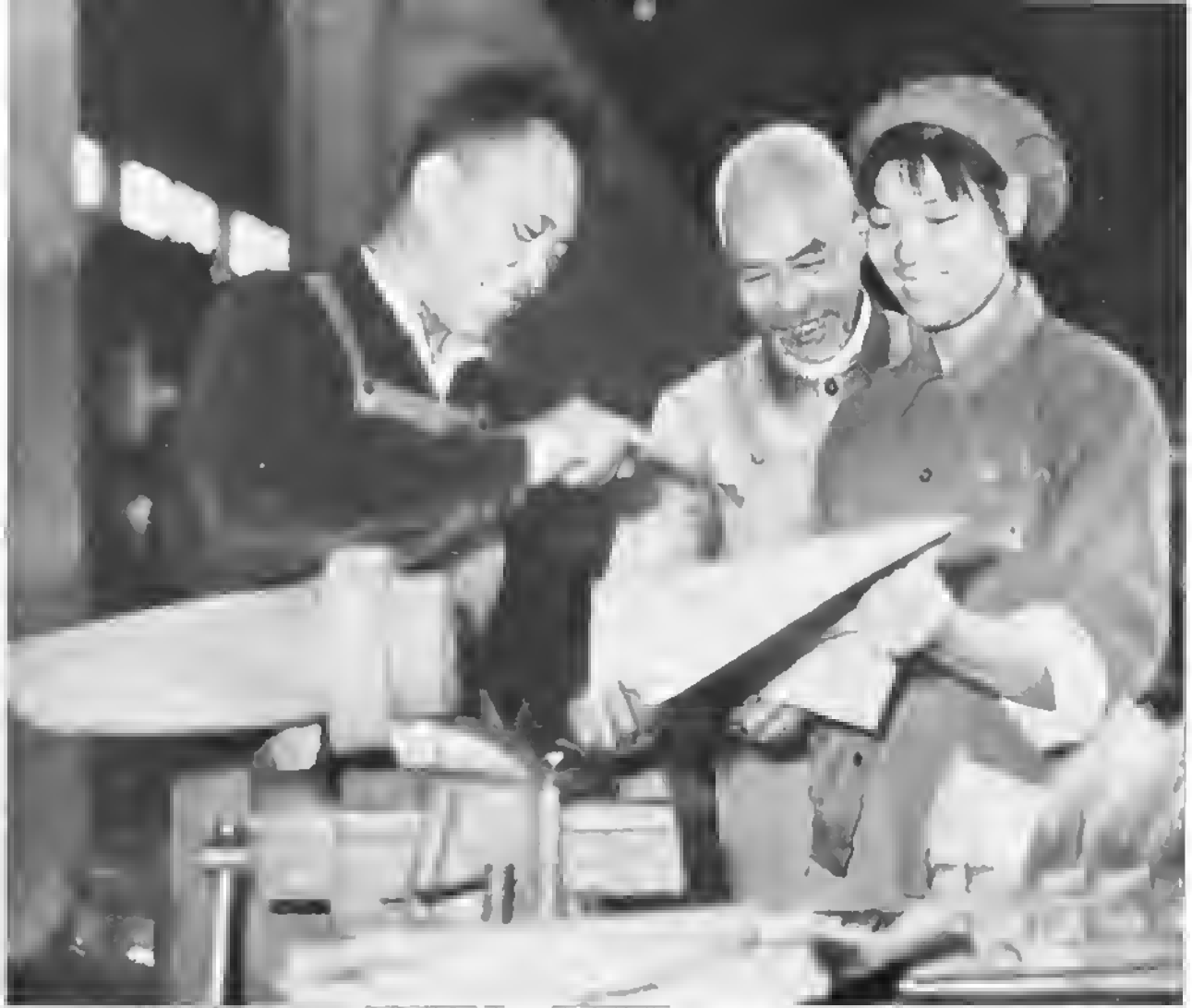
Workers of the Chlnhua Water Turbine Plant summing up their experience.

But the capitalist-roader and the bourgeois authorities would not admit defeat. They ordered a Model 70 made with copper, a superior metal for runners, for another contest. This time, the workers' runner became unsteady at high speed and the turbine shaft began to vibrate. Model 70 had an edge in the second contest. Now the capitalist-roader and bourgeois authorities swaggered and puffed. "We told you your runner could not beat the foreign model," they said, and ordered the workers to stop their experiments.